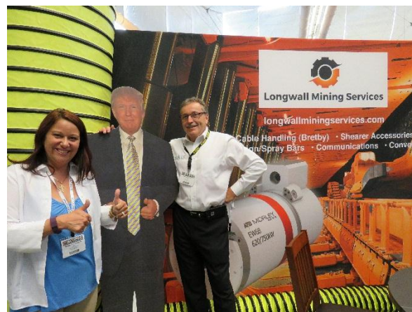
Longwall Mining Services