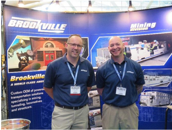
Brookville Mining Division