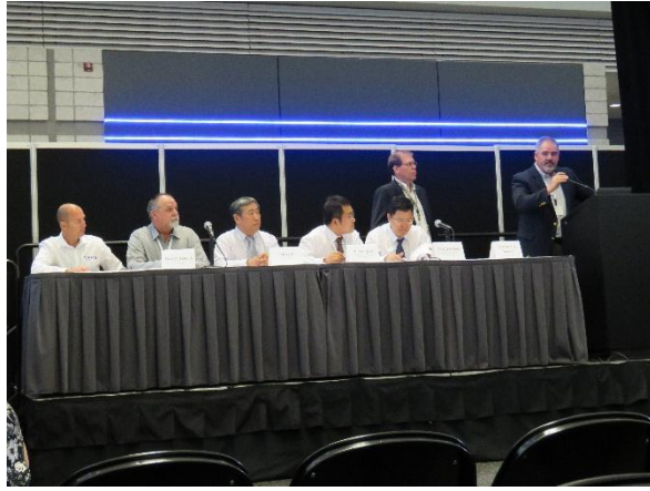
First Technical Session Gets Underway

“Standing Strong” was the theme of 2017 Longwall USA Exhibition & Conference, which was held June 13-15, in its traditional home of the David L. Lawrence Convention Center in downtown Pittsburgh, PA. Since 1985, Longwall USA has become the place to be for professionals in or connected with the technique of longwall mining and this year was no exception. The mood of the attendees was noticeably upbeat as order books begin to fill once again with the end of the war on coal and an Administration who believes in our industry.