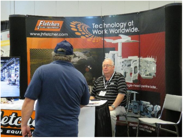
Fletcher Mining Equipment