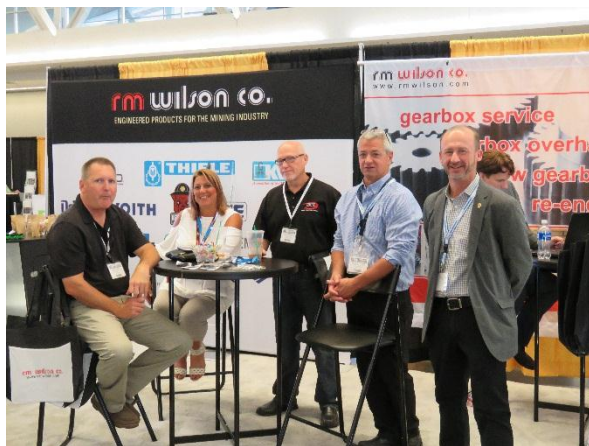
RM Wilson Co.