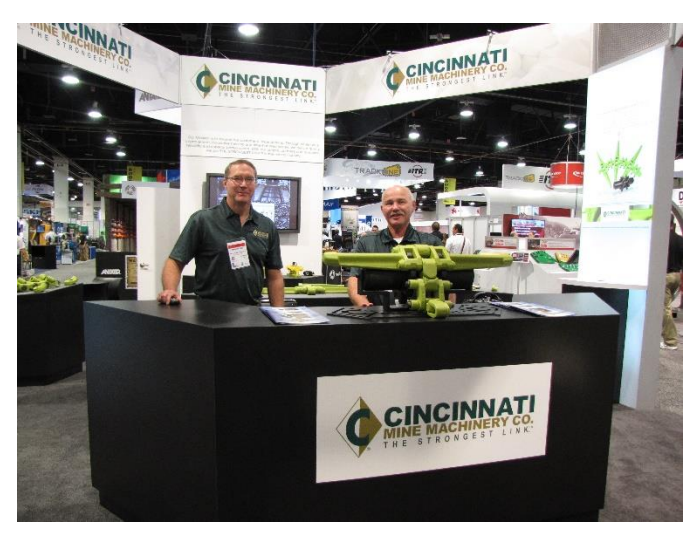
Cincinnati Mining Machinery