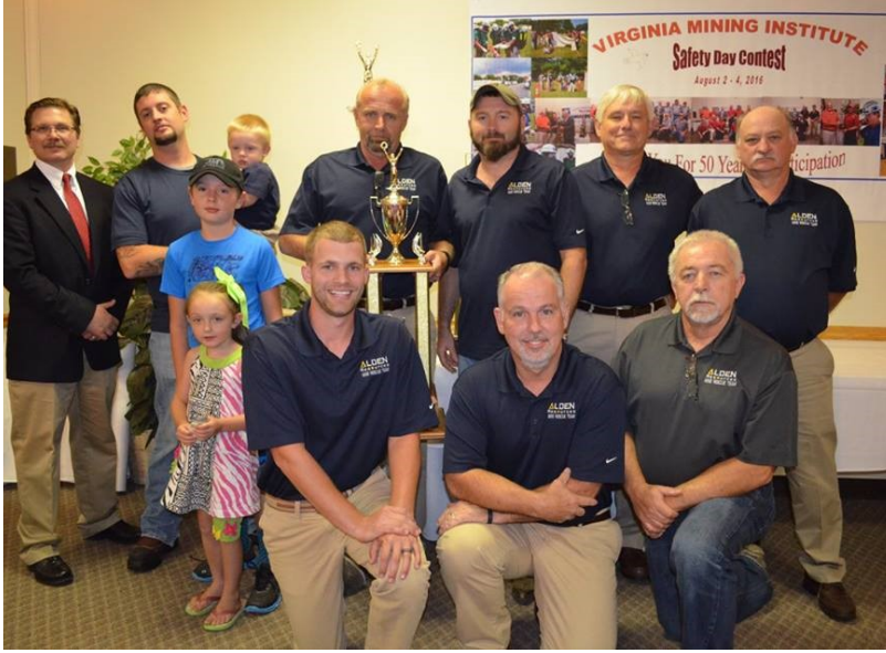
Day 1 Mine Rescue 1st Place: Wellmore Red Team