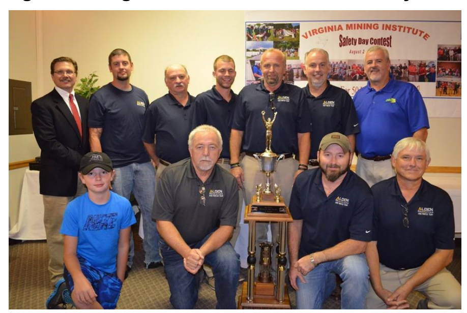
VMI Mine Rescue Champions: Alden Resources from Corbin, KY

Alden Resources Blue Mine Rescue Team took top honors in the Virginia Mining Institute's Mine Rescue Competition held August 3-4. This was the 50th anniversary for the event. The competition was held at the Blacksburg Parks and Recreation Community Center. The rescue and safety contest was sponsored by the Virginia Mining Institute (VMI). The Virginia Department of Mines, Minerals and Energy (DMME), the Mine Safety and Health Administration (MSHA), Kentucky mine officials, Ohio mine officials, West Virginia mine officials, Brick Street and several volunteers that came to help at the event.