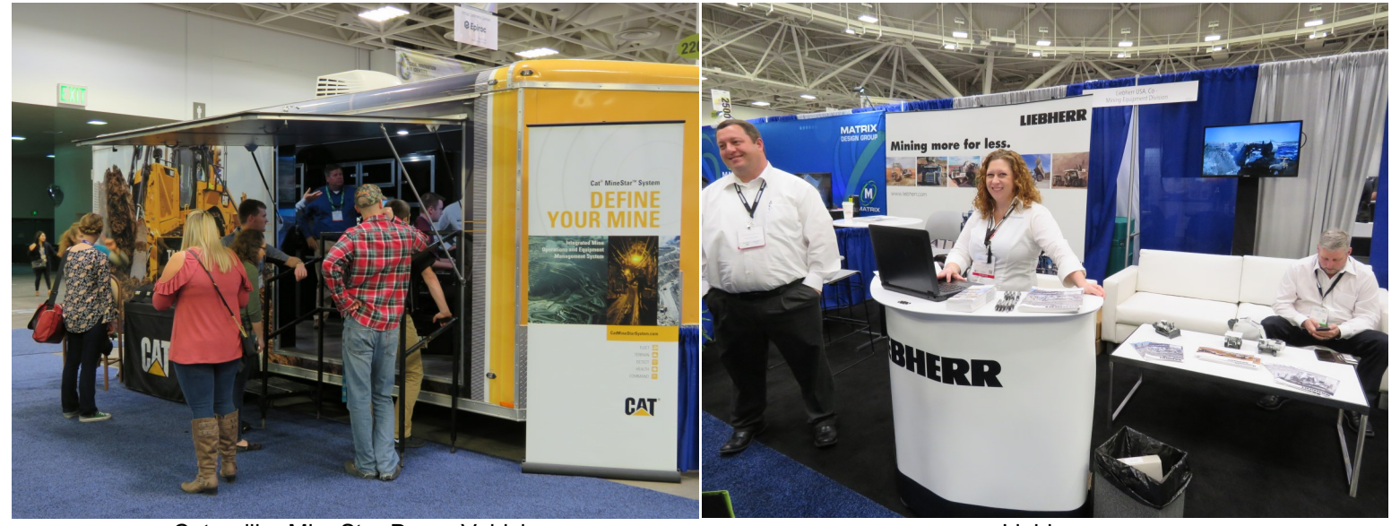
Caterpillar MineStar Demo Vehicle