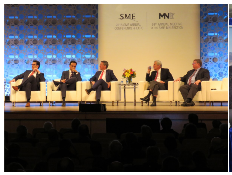
Opening Keynote Session