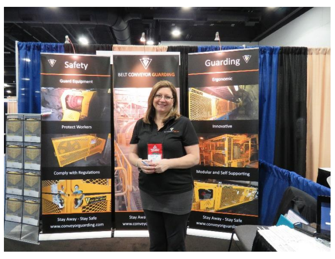
Belt Conveyor Guarding