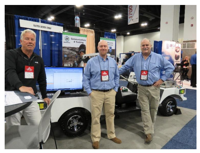
Matrix Design Group