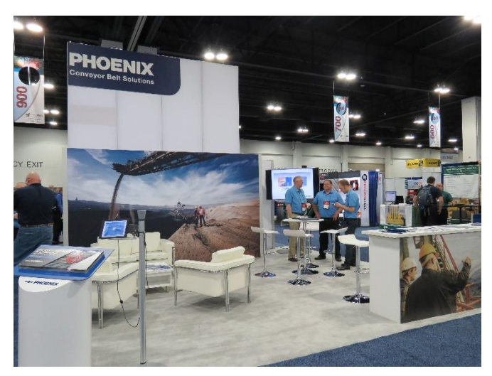
Phoenix Conveyor Belt Solutions

The 2017 SME Annual Conference ran for four days with 120 technical sessions and more than 750 companies exhibiting. The 2018 SME Annual Conference & Expo will be held February 25-28 Minneapolis, MN.