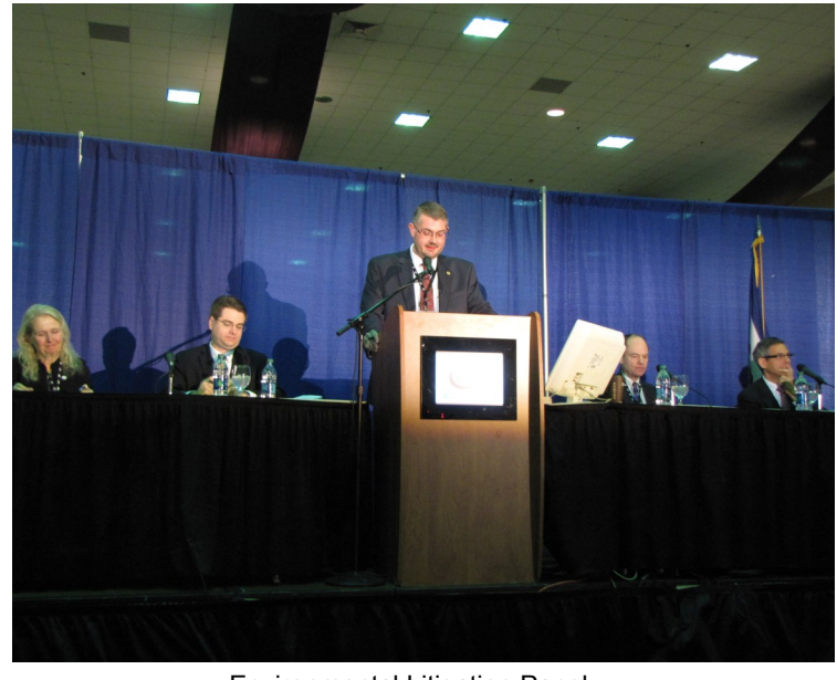
Environmental Litigation Panel