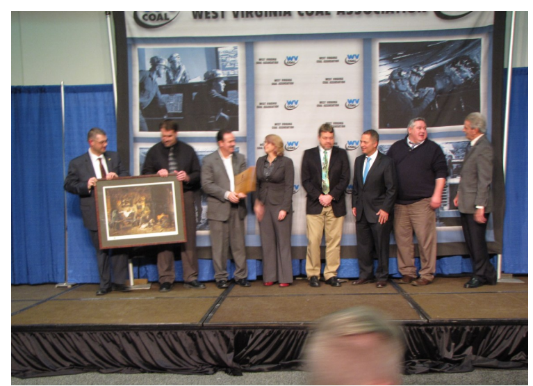
Coal-Mac, Inc. Phoenix No. 1 Surface