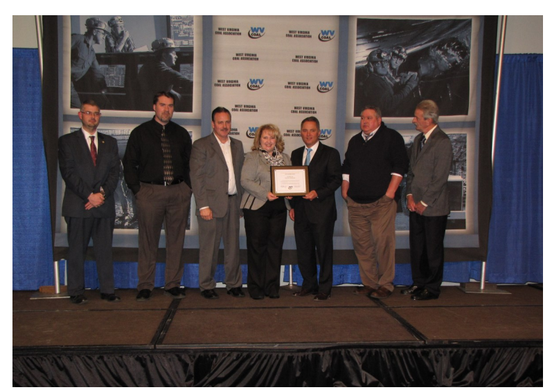
Coal-Mac, Inc. Phoenix No. 4 Surface