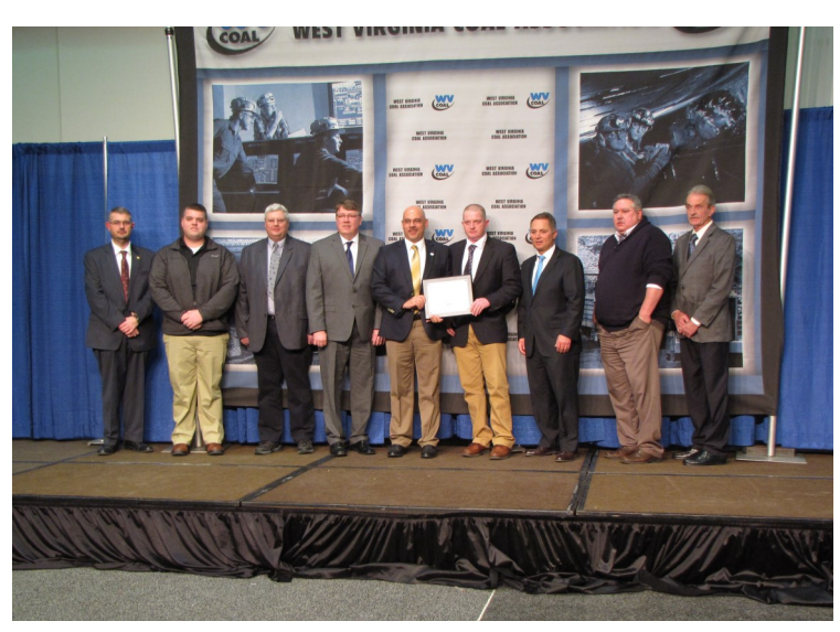
Wolf Run Mining Company, Wolf Run Complex