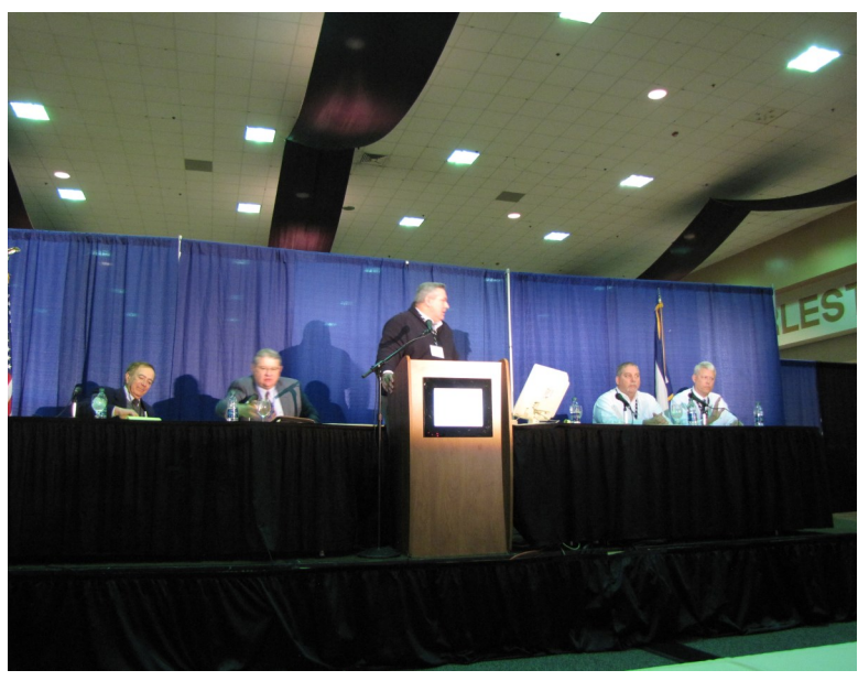
WV Div of Mining & Reclamation Panel