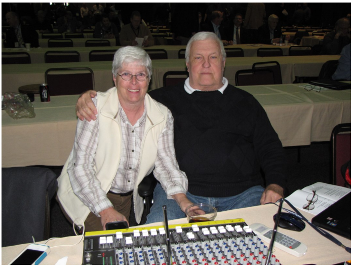
VMI Productions Team